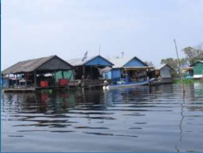
Mobile floating village