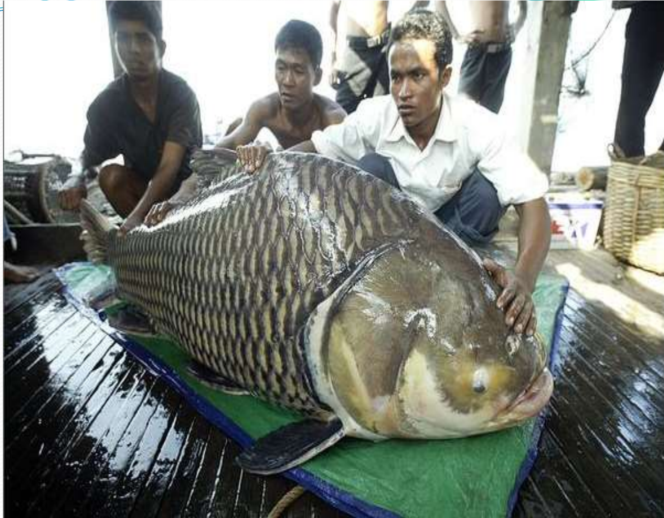
Giant Barb/Giant Carp