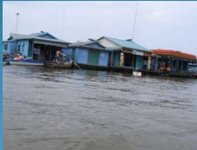
Fixed floating village