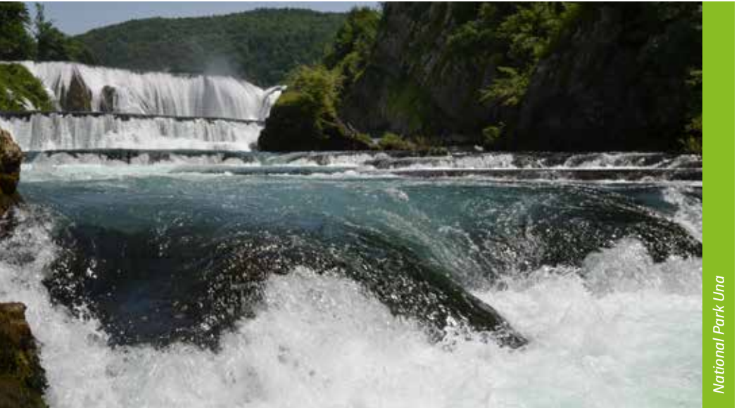
National Park Una

Una is almost with its entire longitudinal cascading river. It is special for its sedentary barriers, which are also the biggest value of the river Una. Sedentary barriers create waterfalls, riverside islands, cascades, beech trees and larger waterfalls associated with tectonic movements. The sediment sedimentation process, in pure natural waters is the result of certain physic-chemical and biological processes of calcite precipitation in karst waters, as a circuit process in strictly certain conditions of biotope, pH, and temperature, saturation of calcium carbonate, calcium and magnesium content. Sedentary barriers (tufa) are formed of soluble calcium carbonate in the waters of this karst river, where in the turbulence of pure and cold water, by the spillage and evaporation of calcium bicarbonate releases carbon dioxide, and precipitates calcium carbonate. Sedimentation of tufa is accelerated by the phytogenic processes which can be particularly pronounced in algae, which consume carbon dioxide from